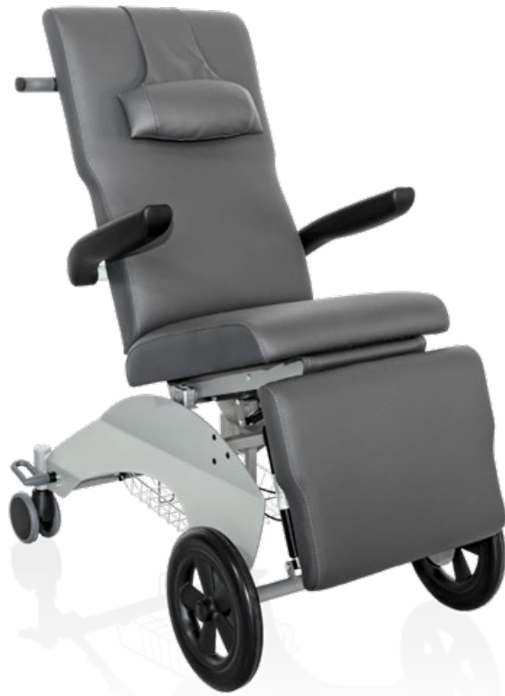
motionLine Item No.: 1700 0000