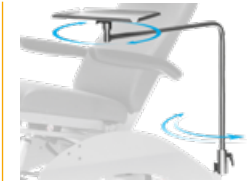
Instrument table 300x200x13 mm, swiveling, detachable, incl. adapter