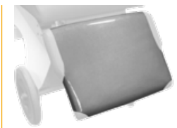
Foot protection foil