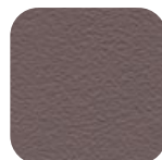
F4340-5015 Item No.: .....198