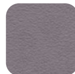
F4340-07432 Item No.: .....002