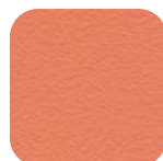
F4340-50619 Item No.: .....214