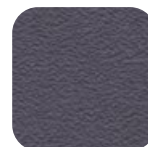
F4340-07445 Item No.: .....030