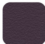
F4340-50621 Item No.: .....199