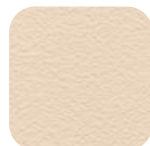
F4340-20130 Item No.: .....084