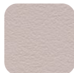
F4340-20162 Item No.: .....205