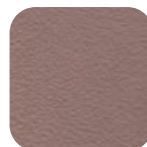
F4340-07496 Item No.: .....046