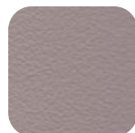
F4340-20150 Item No.: .....204