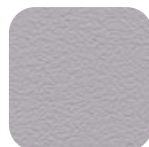
F4340-20161 Item No.: .....206