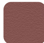
F4340-50623 Item No.: .....216