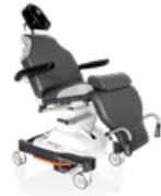
500 XLE comfort