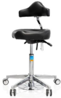
assistPro F Item No.: 2400 0005