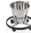
stayClean kick bucket