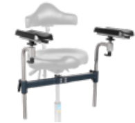
assistPro F Armrest pair incl. traverse