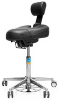
assistTrend Item No.: 2500 0002