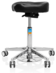
easyPro F Item No.: 2400 0010