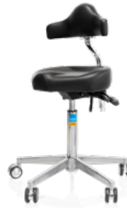
assistPro H Item No.: 2400 0009