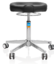
easyPro R Item No.: 2400 0013