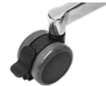
Double rimmed castor, 65 mm, with braking function