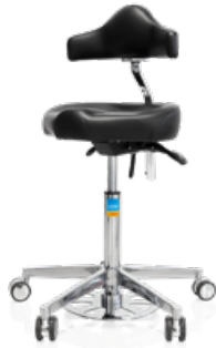
assistPro F Item No.: 2400 0005