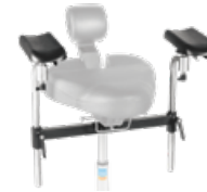
assistTrend Armrest pair incl. traverse