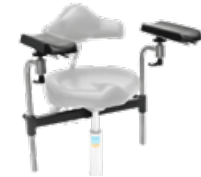
assistPro F Armrest pair incl. traverse