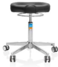
easyPro R Item No.: 2400 0013