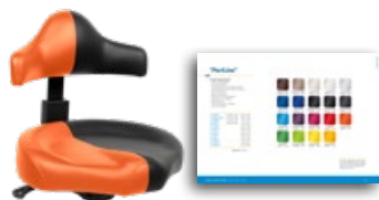
"PeriLine" Page 105

Standard color black Item No.: 3037 0223