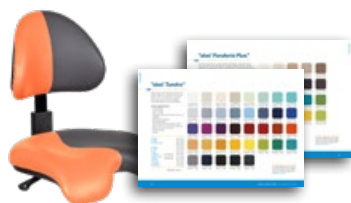
"skai Tundra" Page 102

Standard color anthracite Item No.: 3037 0052