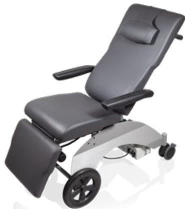
motionLine-E Item No.: 1700 0001