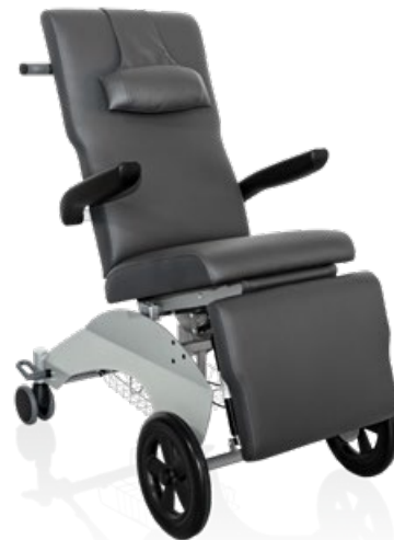
motionLine Item No.: 1700 0000