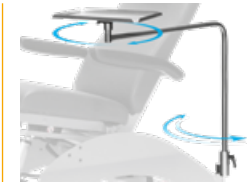
Instrument table 300x200x13 mm, swiveling, detachable, incl. adapter