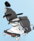
500 XLE comfort