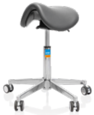
assistLine Item No.: 2400 0015