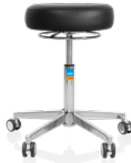
easyLine R Item No.: 2400 0022