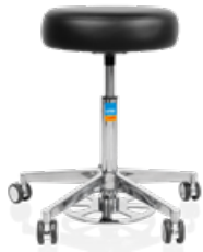
easyLine F Item No.: 2400 0020