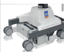
surgiForce light Item No.: 2600 0005