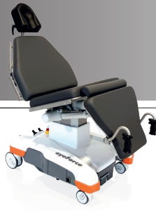
eyeForce Item No.: 1800 0000