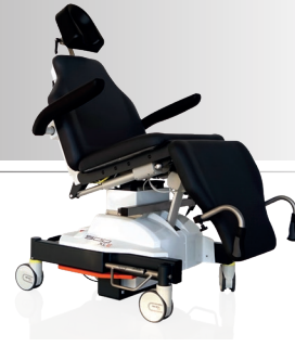
500 XLE Item No.: 1500 0006